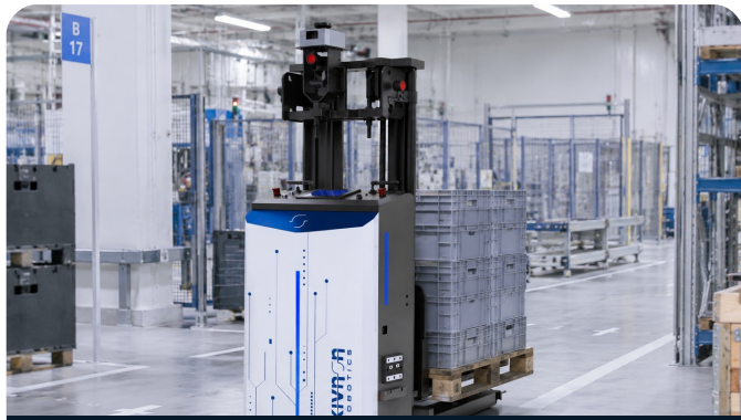
K60 Stacker Series - autonomous high-lift stacking