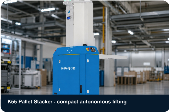
K55 Pallet Stacker · compact autonomous lifting